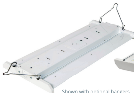
Shown with optional hangers