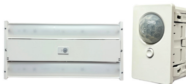
Flush Mount Occupancy Sensor, 347V Order Code: CTL0009

Programmable 360° flush mount sensor designed for the BA Series. Provides reliable motion detection at mounting heights from 10–40 feet, ensuring full-room coverage and energy savings. Ideal for Agricultural, industrial, and commercial spaces.