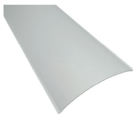
2 Foot Frosted Smooth Acrylic Lens Order Code: LNS0009

Specifically designed for 2-foot BA-Series models, this replacement lid is required when installing the flush mount occupancy sensor. Ensures a secure fit and proper functionality.