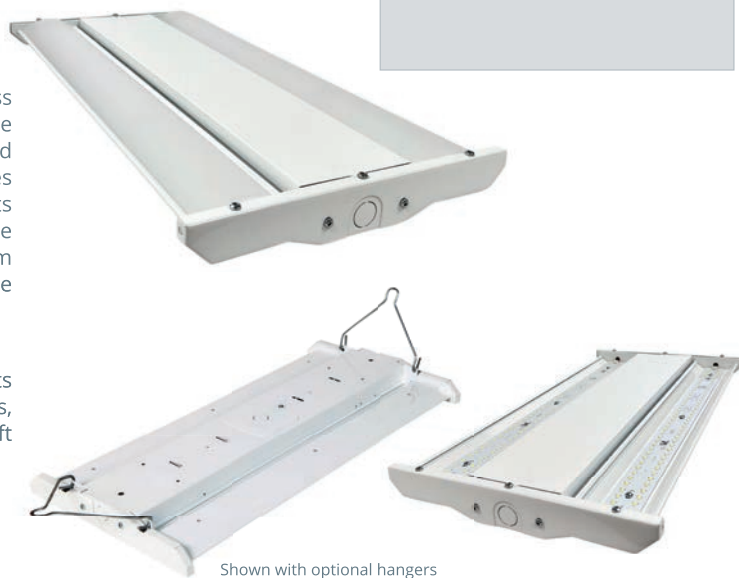
Shown with optional hangers

Approved for use in Canada and USA, QPS certified. Includes standard 5-year warranty—view our warranty policy for complete details.