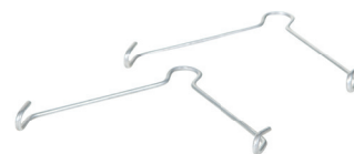
Chain Mount Hook For BA-Series Fixtures Order Code: HDW0001

Programmable 360° flush mount sensor designed for the BA Series. Provides reliable motion detection at mounting heights from 10–40 feet, ensuring full-room coverage and energy savings. Ideal for Agricultural, industrial, and commercial spaces.