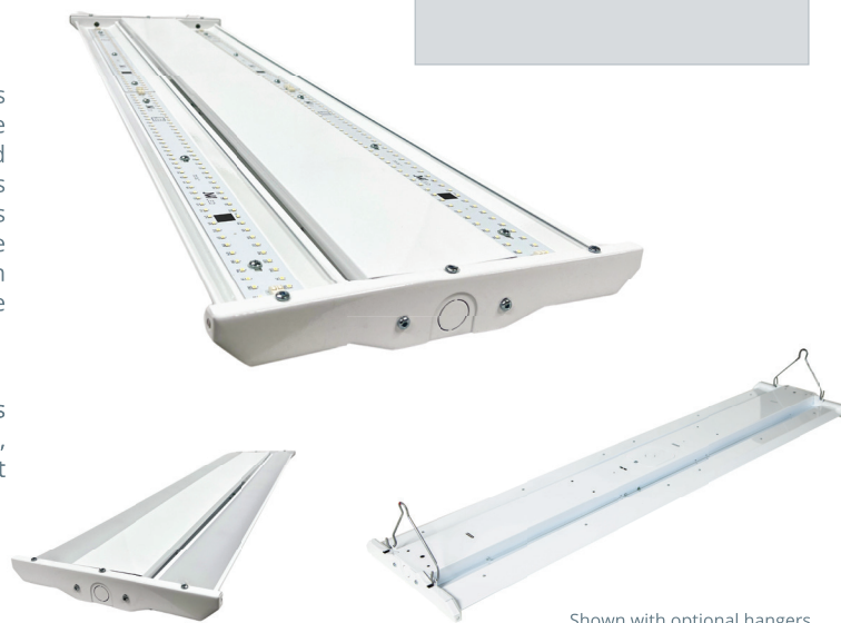
Shown with optional hangers

Approved for use in Canada and USA, QPS certified. Includes standard 5-year warranty—view our warranty policy for complete details.