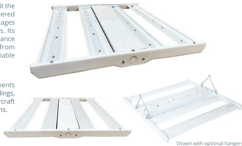
Shown with optional hangers

Approved for use in Canada and USA, QPS certified. Includes standard 5-year warranty—view our warranty policy for complete details.