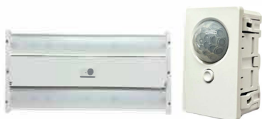
Flush Mount Occupancy Sensor, 120-277V Order Code: CTL0004

Programmable 360° flush mount sensor designed for the BA Series. Provides reliable motion detection at mounting heights from 10–40 feet, ensuring full-room coverage and energy savings. Ideal for Agricultural, industrial, and commercial spaces.