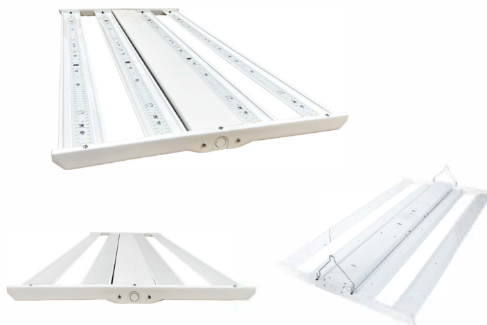
Shown with optional hangers

Approved for use in Canada and USA, QPS certified. Includes standard 5-year warranty—view our warranty policy for complete details.