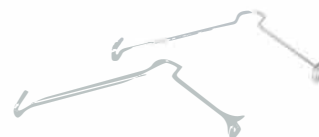
Chain Mount Hook For BA-Series Fixtures Order Code: HDW0001

Programmable 360° flush mount sensor designed for the BA Series. Provides reliable motion detection at mounting heights from 10–40 feet, ensuring full-room coverage and energy savings. Ideal for Agricultural, industrial, and commercial spaces.