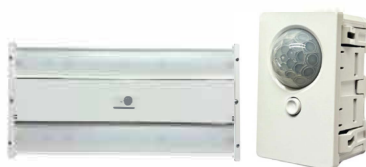
Flush Mount Occupancy Sensor, 347V Order Code: CTL0009

Programmable 360° flush mount sensor designed for the BA Series. Provides reliable motion detection at mounting heights from 10–40 feet, ensuring full-room coverage and energy savings. Ideal for Agricultural, industrial, and commercial spaces.