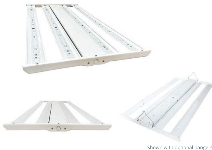
Shown with optional hangers

Approved for use in Canada and USA, QPS certified. Includes standard 5-year warranty—view our warranty policy for complete details.