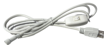
Order Code: WIR0008 5 foot power cord with a on/off switch and male plug