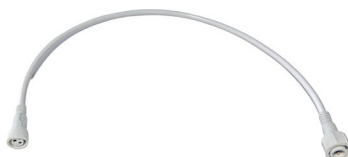
Order Code: WIR0009 2 foot jumper/extension cord