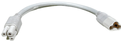
Order Code: WIR0013 12 inch jumper/extension cord