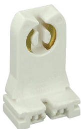
Order Code: ELC0015 T8 slide in tombstone non shunted