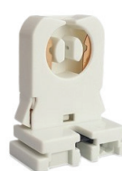
Order Code: ELC0014 T8 snap in tombstone non shunted