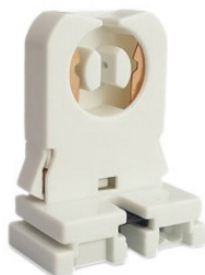
Order Code: ELC0014 T8 snap in tombstone non shunted