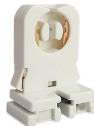
Order Code: ELC0014 T8 snap in tombstone non shunted